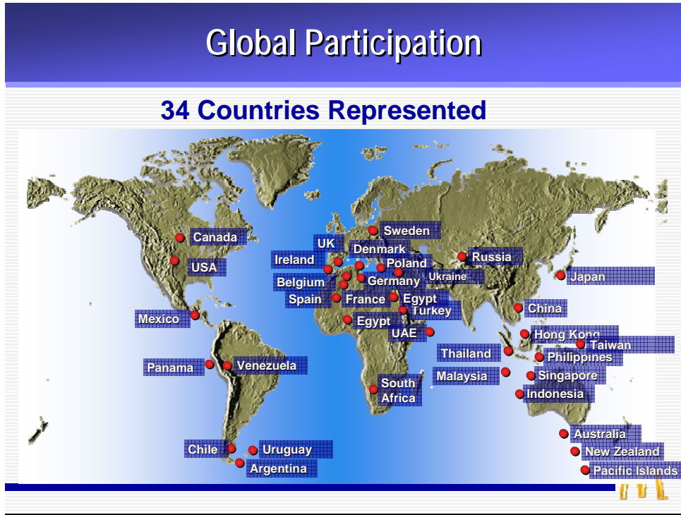
Exhibit 8 LAMP Participants by Country